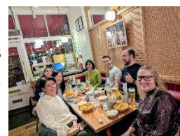
Dec 25 Christmas Team Meal

Heartfelt thanks from the Network Management Team (that's us below) for your hard work, dedication and support as always. Wishing you all a Merry Christmas and a Happy New Year with further collaboration.